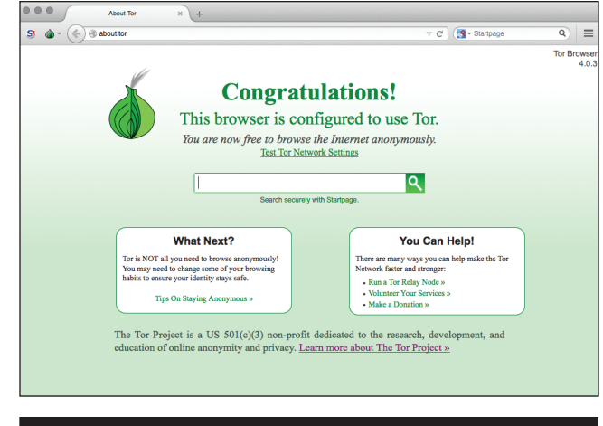
Figure 4. The Tor Browser when opened. Notice the Startpage search engine (in the center of the screen and on the top right as a search bar), as well as the NoScript extension (top left) and Tor Button (top left). The HTTPS Everywhere extension is not displayed, but it's installed.

After you've successfully connected, your browser will open with the message seen in figure 4: "Congratulations, your browser is configured to use Tor!" Now, take a moment to look around. You'll notice the default search engine is Startpage, which is an anonymous search engine that doesn't track you. The Tor Browser also comes with two extensions installed: HTTPS Everywhere and NoScript. HTTPS Everywhere is an awesome tool from the Electronic Frontier Foundation that forces compatible websites to use HTTPS by default for added browsing security.<sup>8</sup> NoScript (https://noscript.net) is an extension that blocks Javascript, Java, and Flash, because these scripts can deanonymize Tor Browser users. It's not