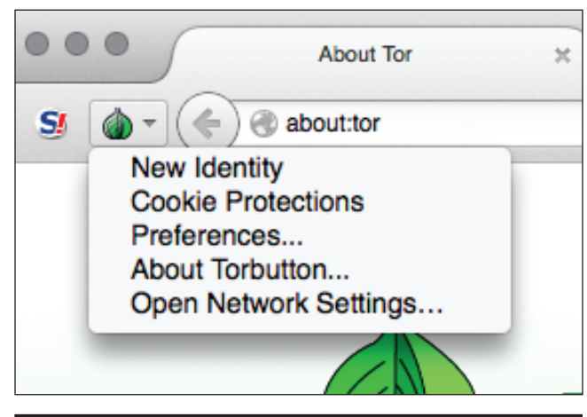
Figure 5. The Tor Button with its menu open.

Figure 4. The Tor Browser when opened. Notice the Startpage search engine (in the center of the screen and on the top right as a search bar), as well as the NoScript extension (top left) and Tor Button (top left). The HTTPS Everywhere extension is not displayed, but it's installed.