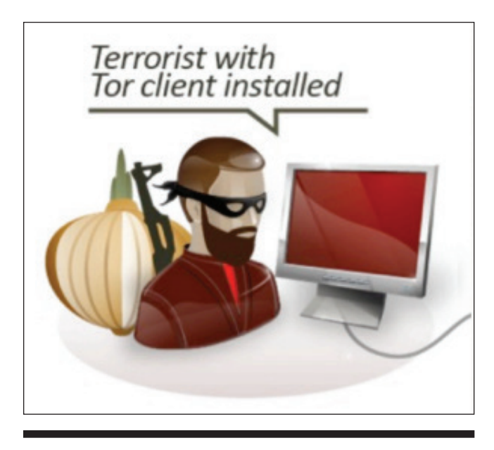
Figure 1. "Terrorist with Tor client installed" from one of the NSA slides revealed by Edward Snowden to Glenn Greenwald in June 2013.

alarming statistic, one that shows how much surveillance threatens free expression. There are few things librarians care more about than intellectual freedom, and Tor can help our local communities protect that freedom. This is why libraries should be installing the Tor Browser on all public PCs, running Tor relays from our networks, and teaching the public what Tor is and how they can use it to protect themselves.