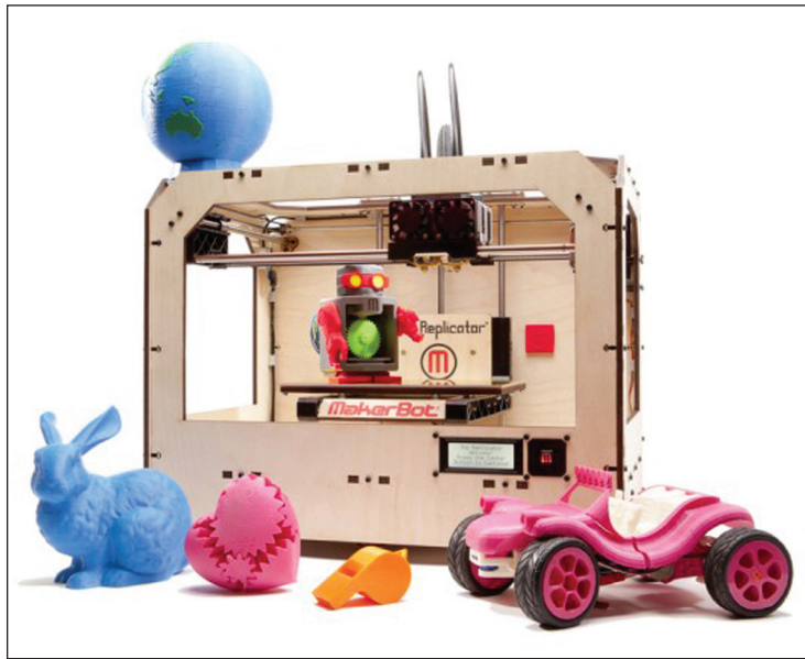
Figure 2.1 MakerBot Replicator

The printhead is a metal tube with a heating element and thermistor to control the temperature. The plastic substrate is melted by the heat of the printhead, and pressure is applied by forcing more plastic in, causing some of the liquid plastic to extrude through a small nozzle that ranges from .2 mm to .5 mm in size.