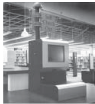
Tech Logic Patron Self-charging Station.