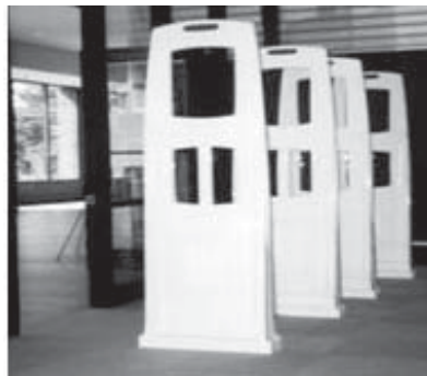
VTLS Exit Sensors.

Since a theft bit is in the tag, no need exists for interfacing the exit sensors with an automated library system. At the option of a library, the exit sensors can be interfaced with the automated library system and the information captured by the exit sensors transmitted to the automated library system.