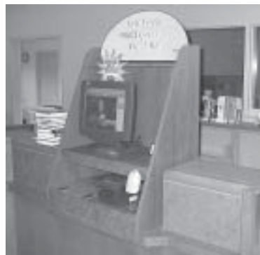
Vernon Patron Self-charging Station.

Tagsys does not produce patron self-charging stations, preferring to let its distributors select one from a third-party vendor or manufacture their own. As the RFID system is SIP2-compliant, so only minor work by the distributor is required.