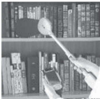
Tagsys Portable Reader.

Tagsys offers a portable reader with a long flexible antenna for reaching high and low shelves without stretching or bending. The antenna can be used for inventorying or for searching for a specific item. It also identifies out-of-place items on the shelf.