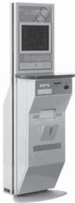
VTLS Patron Self-charging Station.

Tagsys does not produce patron self-charging stations, preferring to let its distributors select one from a third-party vendor or manufacture their own. As the RFID system is SIP2-compliant, so only minor work by the distributor is required.