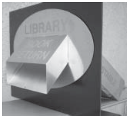
Birchard Co's Through-the-wall Bookdrop Reader.

As an alternative to a sorter to separate holds from items to be reshelfed, a report of items returned, but not to be reshelfed, can be produced. The report would include items on hold, to be sent to cataloging, or another next action.