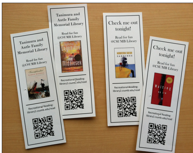
Figure 4. Promotional bookmarks

the collection circulated. Fortunately, the Voyager APIs also enable one to retrieve usage statistics for the titles in each genre. Just before going live with the site at the start of the 2011–12 academic year, benchmark circulation data were generated for the two preceding years, giving us an average annual rate of circulation for each genre. Twelve months later another set of circulation data was generated for comparison. As table 1 illustrates, most genre collections experienced an increase in use during the first year the virtual collection was available, particularly Mysteries, Short Stories, Love and Romance, and Humor. We saw a 21.6 percent increase in circulation, a strong indication that organizing, presenting, and promoting these materials succeeded in bringing them to the attention of our user community.