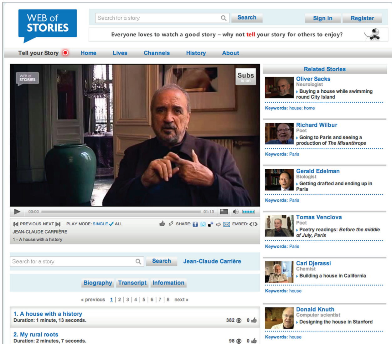
Figure 2.3 Example of Web of Stories player interface and chapter options

tell their life stories—upbringing, memories, education, career—and the interviews are all available as documentaries or chapter-sized clips for bite-sized viewing (see figure 2.3).