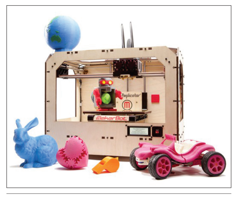
Figure 2.1 MakerBot Replicator

The printhead is a metal tube with a heating element and thermistor to control the temperature. The plastic substrate is melted by the heat of the printhead, and pressure is applied by forcing more plastic in, causing some of the liquid plastic to extrude through a small nozzle that ranges from .2 mm to .5 mm in size.