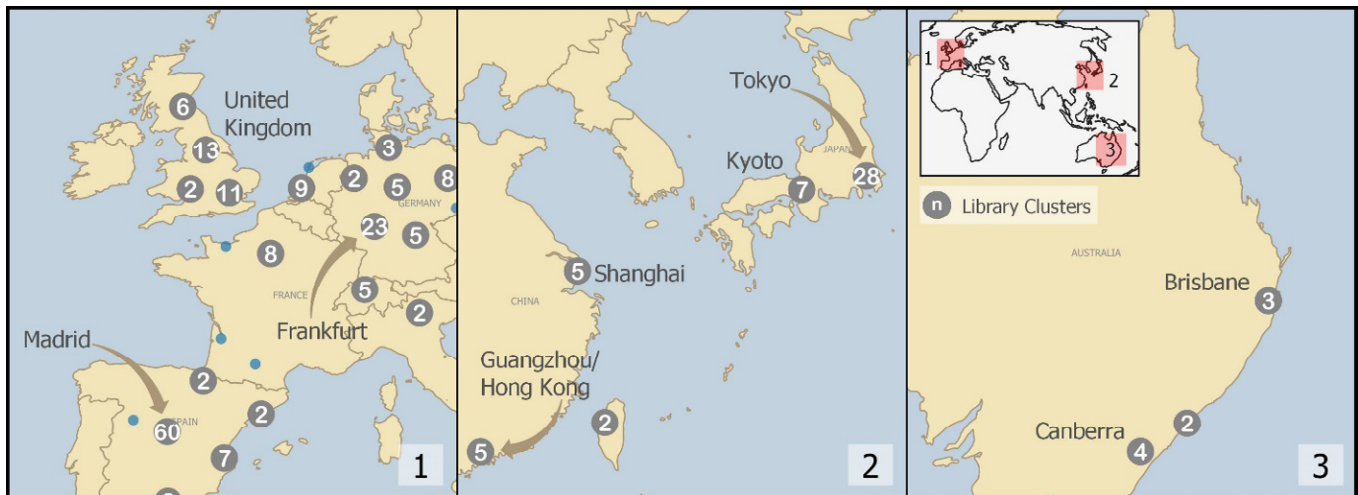
Figure 3. Map depicting clusters of libraries in areas beyond North America where nearest copies of items most often occurred. 1. Western Europe; 2. East Asia; 3. Australia.

of commonly held or regionally prevalent items may further help libraries to limit the amount of upfront work needed, and perhaps minimize the need to compile additional data on OCLC holdings or geographic scarcity for this subset of materials.