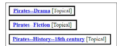
Figure 3. Subdivisions of the Subject Heading Pirates