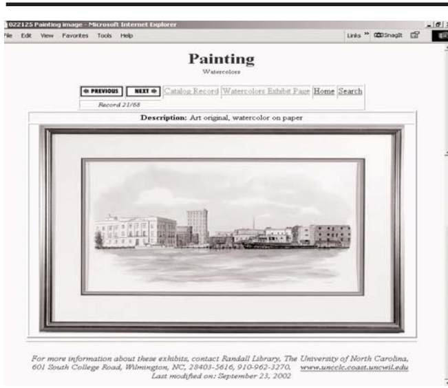
Figure 5. PastPerfect Web tour enlarged image