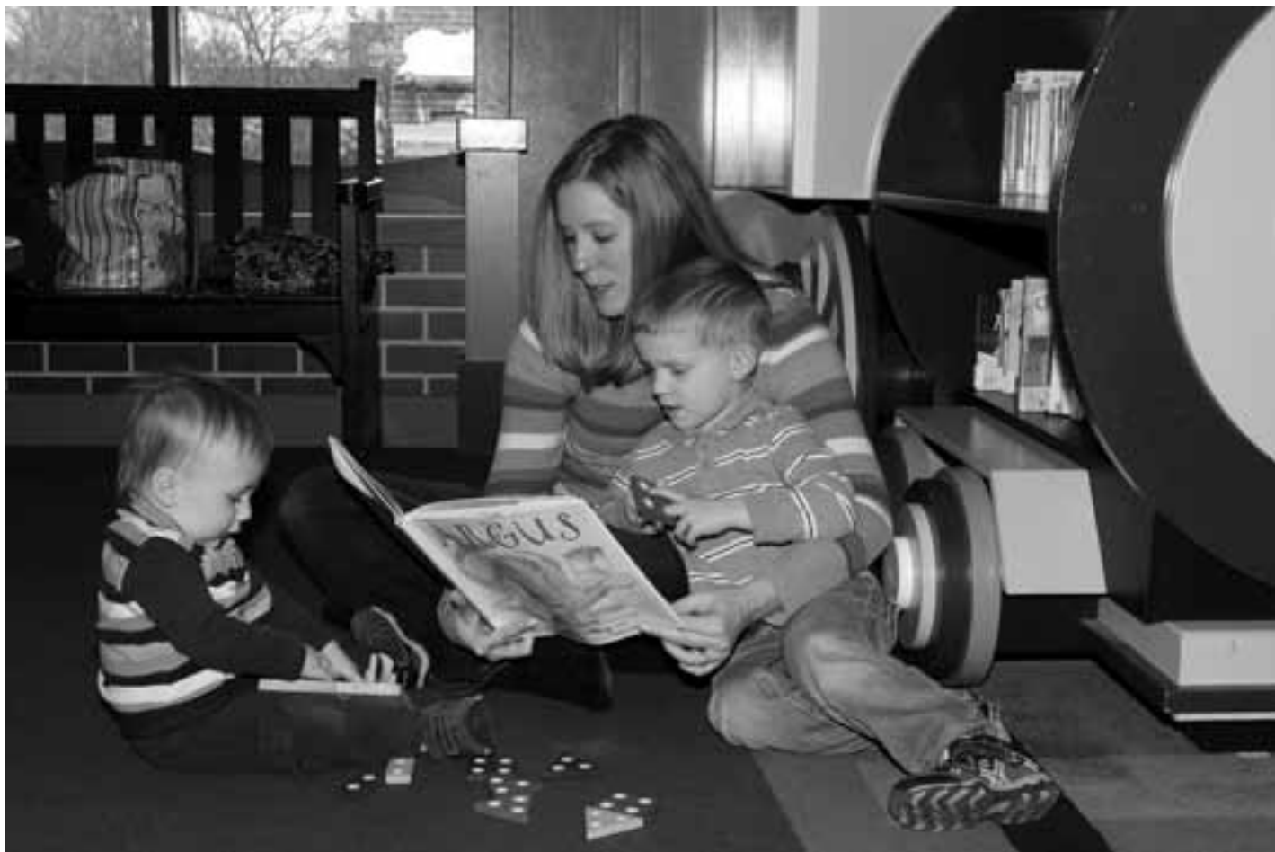
Libraries are winning the hearts of families at the Carroll County (MD) Public Library, Westminster Branch.

learning and how to convey their excitement of learning to their children. It's also a golden opportunity to ask parents how can the library better serve families. It is one example of how libraries can pursue a role in the Early Learning Challenge initiative.