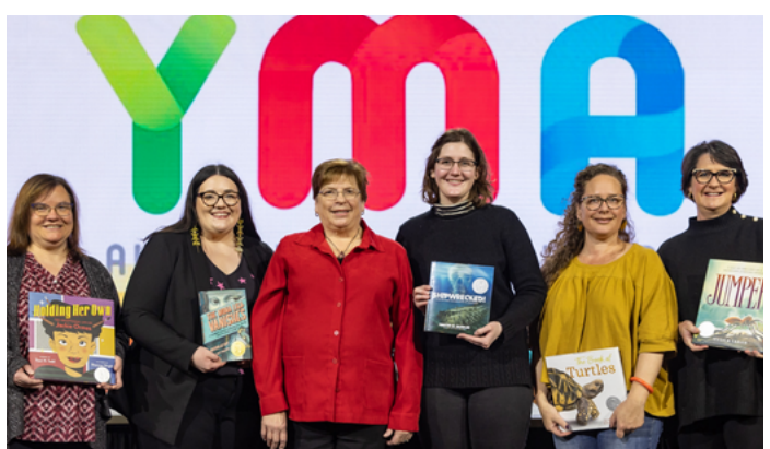
Sibert committee members presenting the most distinguished informational books for children published in 2023!