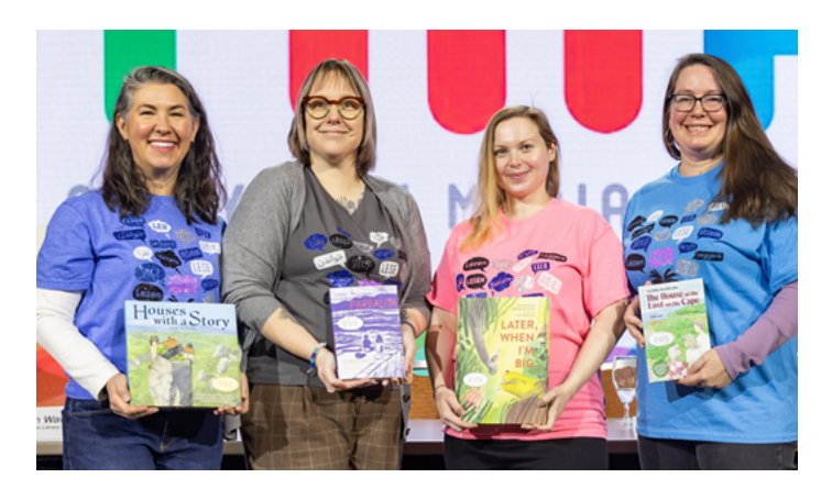
Members of the Batchelder committee displaying their award and honor books and modeling their awesome and apropos t-shirts featuring speech bubbles that contain the word "read" in multiple languages.

in Baltimore this past January. After a year of reading, listening, discussing, and deliberating, these members came together in January, chose their 2024 winners, and had the opportunity to celebrate and gather for photos during the Youth Media Awards press conference.