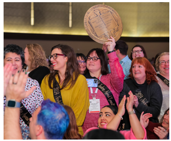
Newbery committee members stand to be recognized during the press conference.