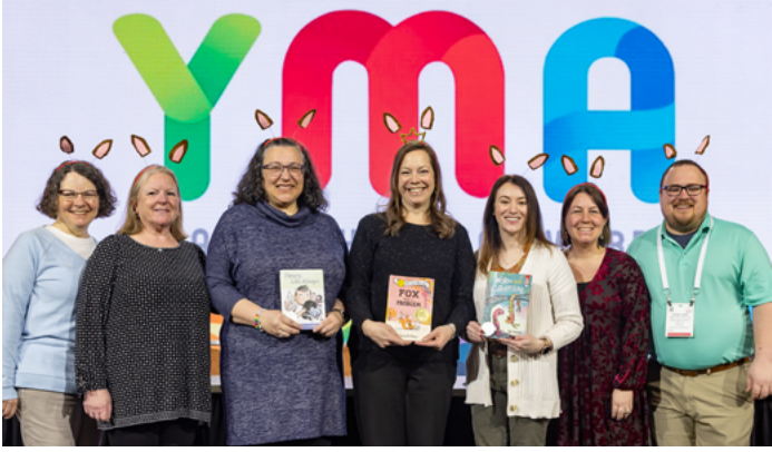
Geisel committee members, complete with fox ears, pose with their 2024 winners.