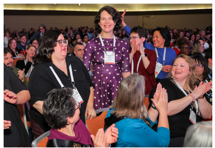
Members of the Pura Belpré committee are recognized by colleagues during the press conference.