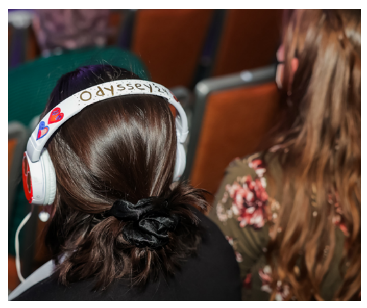
Odyssey committee members donned their headphones for the announcement of their winners.