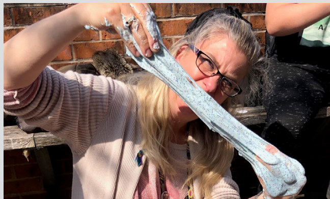
We relied on our outside patio as a venue for our sticky make-your-own-slime program.