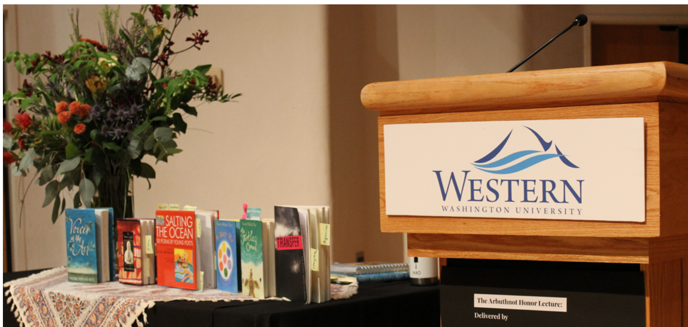
The podium at Western Washington University Performing Arts Center, site of the 2018 Arbuthnot Honor Lecture